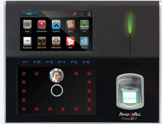
FingerTec® Face ID 2 2-in-1 Face & Fingerprint Recognition Reader